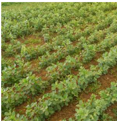
Real Market Gardening & Vegetable crops: onion, radish, field bean