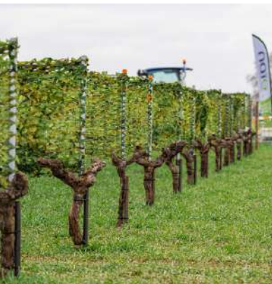
Row of duplicates Vineyards