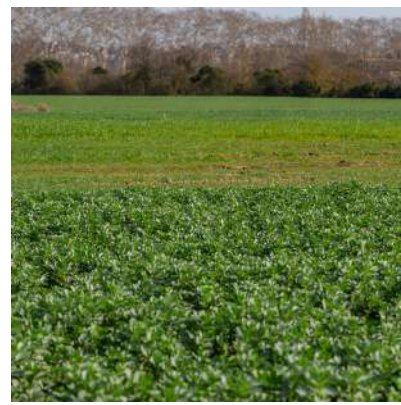
Cultivated Field crops: rye