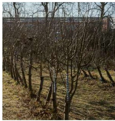
3,000 sq. m. Orchards Apple trees in winter condition