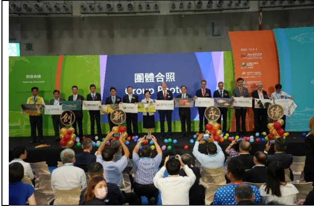
2023 Opening Ceremony